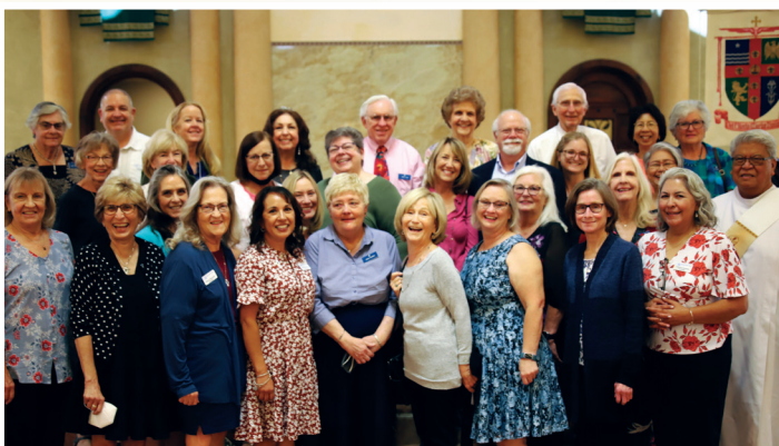
Many of the SND Associates from the California region attended the jubilee.

The two years I worked with mentally challenged women at Marian Homes in Walnut and Anaheim were particularly meaningful. Some of the residents needed a lot of help with personal care, several had jobs, while some went to special needs day care programs. Their challenges were varied, including Downs Syndrome, schizophrenia, scoliosis and legal blindness. Everyone from the three group homes gathered for monthly birthday parties. The most popular house had a pool—so I had to take a lifeguard class! Overall, the residents' simple approach to life taught me what is most important.