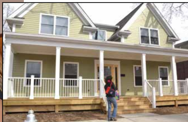
House of Champions' new home