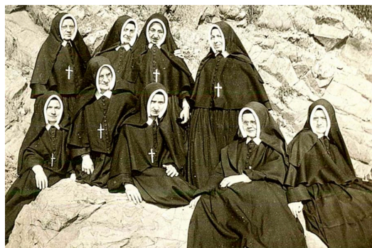
SND pioneers at the beach circa 1925...

...thank you for being part of our great story!