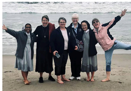
and those who followed in 2024